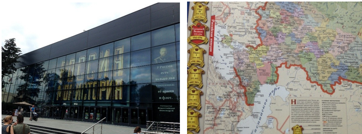
Image 7 shows the entrance to the exhibition space, and Image 8 reveals the constitutive parts of the Russian Federation with the date of each town and administrative unit indicated. Crimea is shown to have joined the country in 1855 which helps the organisers avoid most recent controversies.