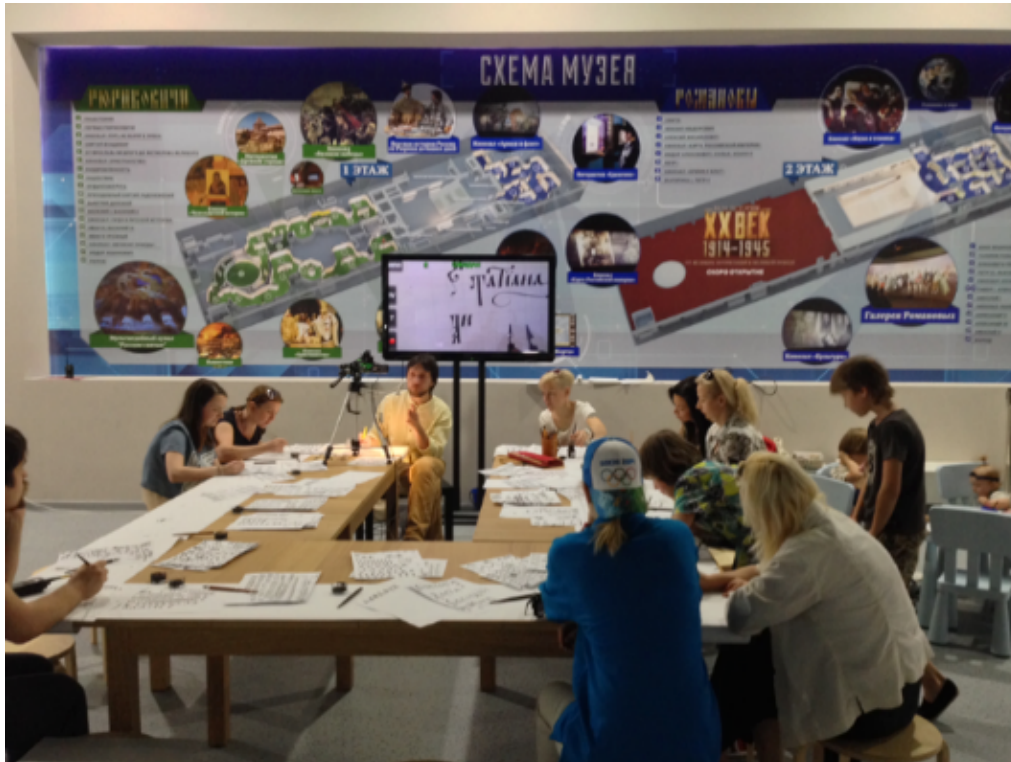
Image 12 showcases participatory forms of patriotism alongside immersive consumption. The instructor—the man in the yellow shirt—is teaching a free course on Orthodox calligraphy. His instructions—the movement of the pen—are delivered with the help of a camera which mediates his actions on the television screen for instantaneous consumption. Note the Sochi Olympic logo on the cap of the man in the foreground.