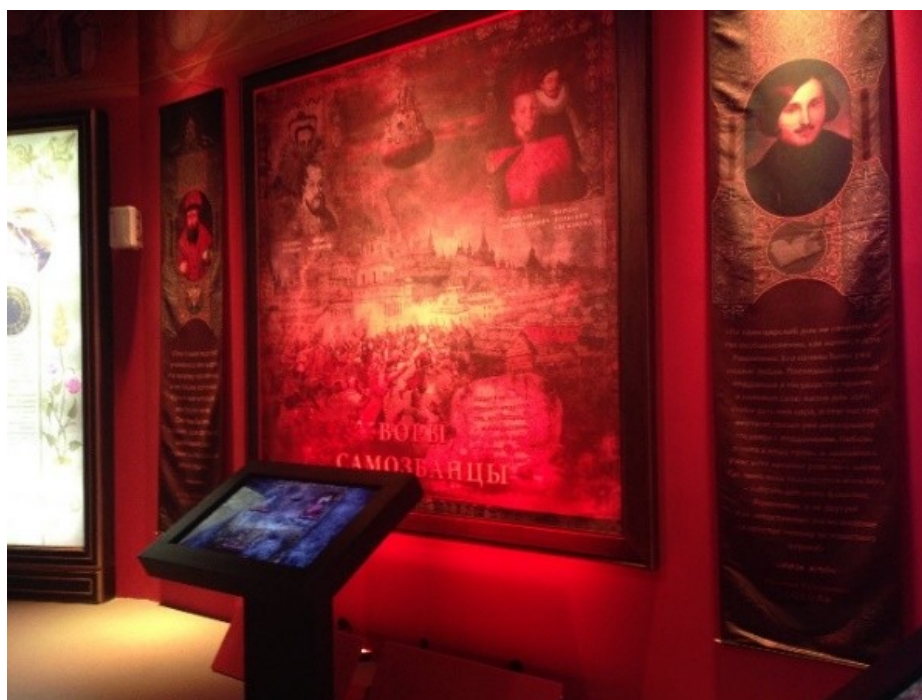
Image 11 exemplifies the use of multi-media displays to promote patriotism wherein patriotism emerges as an intermedial construct, or a discursive selfie inviting the visitor to consume it as a self-image, not as a context for critical examination.