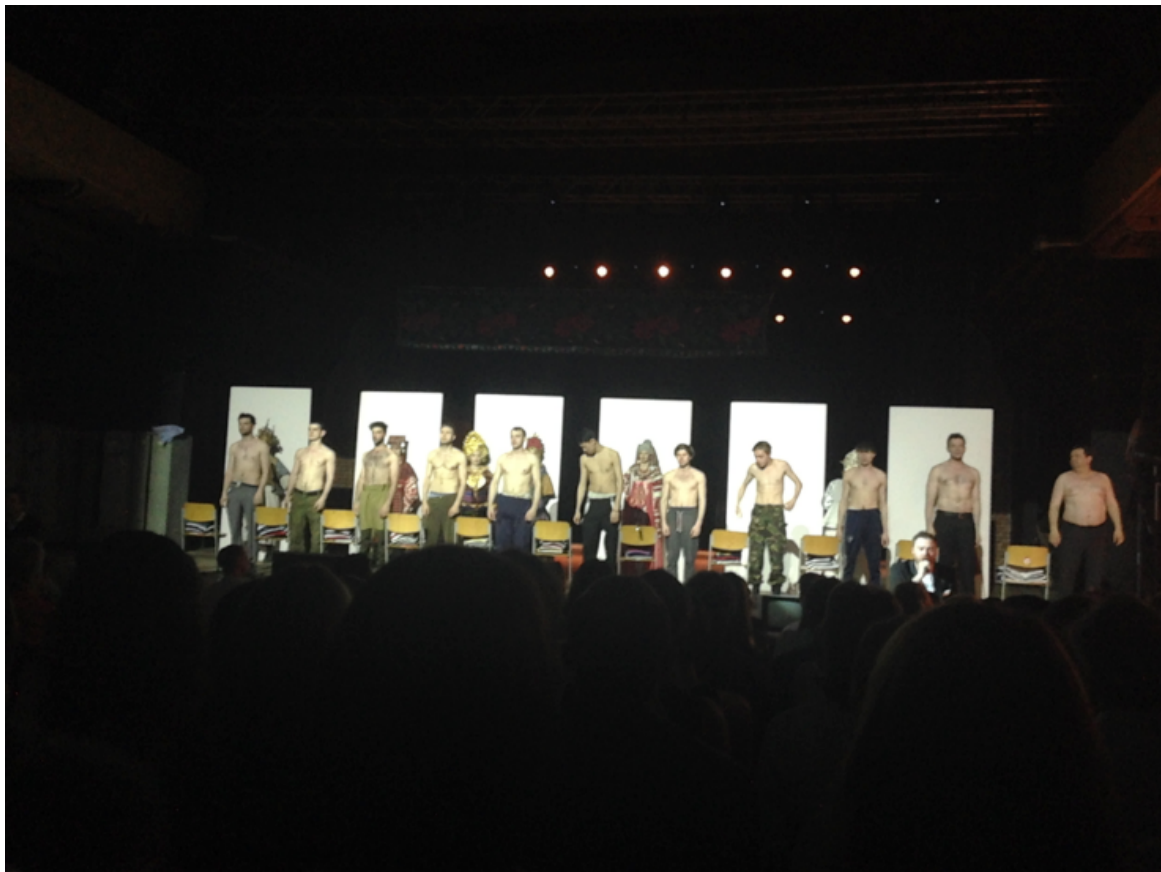
Image 17. (Non-)wearing patriotic T-shirts: the naked truth of (non-)consumption.

The performance concludes with the actors lining up at the front of the stage. As they stand facing the audience, male actors start putting on T-shirts featuring a patriotic slogan. Each actor puts on about a dozen T-shirts thus creating a consumer spectacle of patriotism. Here affective action is mixed with global visibility (the T-shirts were made in China and printed in the EU), emphasizing the continuity of visual styles and wearable formats. Patriotism attains a sensory quality as it serves as an overlay on the skin (T-shirts). Thus, Serebrennikov critically explores different kinds of patriotism where cultural memory is made available for sensory consumption. His actors reflect on the nature of the visual image—it is both a representation and an exhibition—as it creates a sense of belonging among the members of the audience whilst the consumer is constructed as an embodied eye. The T-shirts worn one on top another represent the layers of temporalities of the patriotic sentiment; the T-shirts emerge as symbols of social (im-)mobilisation (with a dozen T-shirts on, the actors can hardly move).