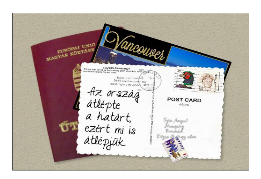
Image 2 . 'The country crossed a border, so we will cross it, too', the logo of the Bordercrossing community.

The public blog and Facebook page called 'Bordercrossing' (Határátkelő) is an online platform dedicated to the theme of emigration. The Facebook page has almost 54 000 followers. The blog.hu website has a section per continent, and volunteer editors are responsible for each country. People write pieces directly for the Bordercrossing site, connected to themes discussed on the blog. The site also reviews or re-publishes practically everything that becomes available online related to the topic of Hungarian migration, including personal blogs, research articles, opinion pieces. Thus it serves as a valuable resource and archive. There is significant commenting activity in the blog community. The site has a critical attitude towards today's Hungary. Its logo, containing a single sentence pun from the Facebook page 'About' section, refers to being fed up with what is happening in the country: 'The country crossed a border, so we will cross it, too'.