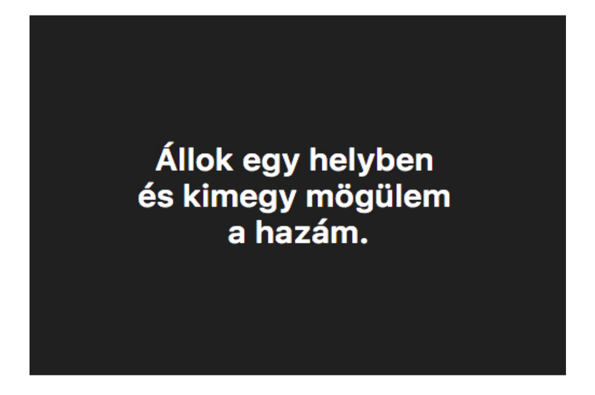
Image 1. 'I am standing in the same place, and my homeland is leaving from behind me'.