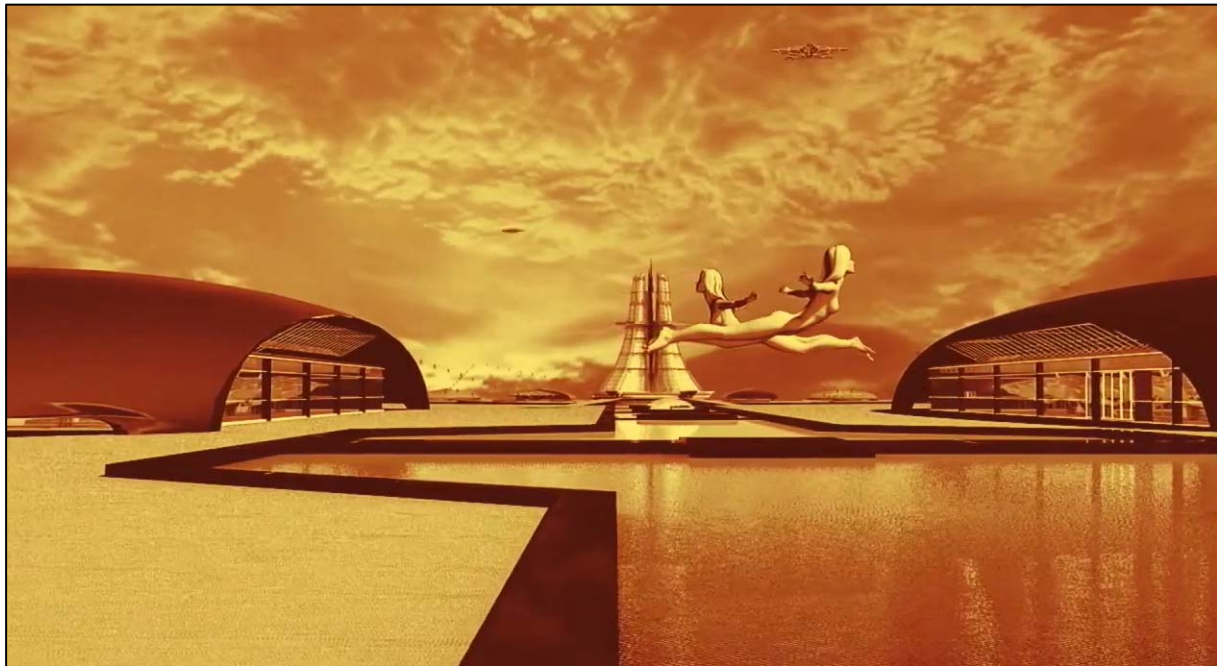
Image 6. Alexey Beliayev-Guintovt. 55° 45' 20.83" N, 37° 37' 03.48" E. Photograph of digital video.