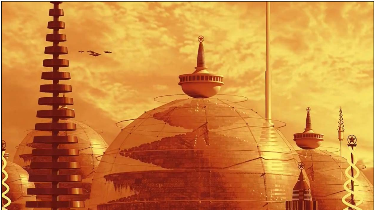
Image 1. Alexey Beliayev-Guintovt. 55° 45' 20.83" N, 37° 37' 03.48" E. Photograph of digital video