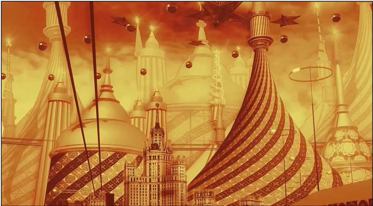
Image 2. Alexey Belayev-Guintovt. 55° 45' 20.83" N, 37° 37' 03.48" E. Photograph of digital video.