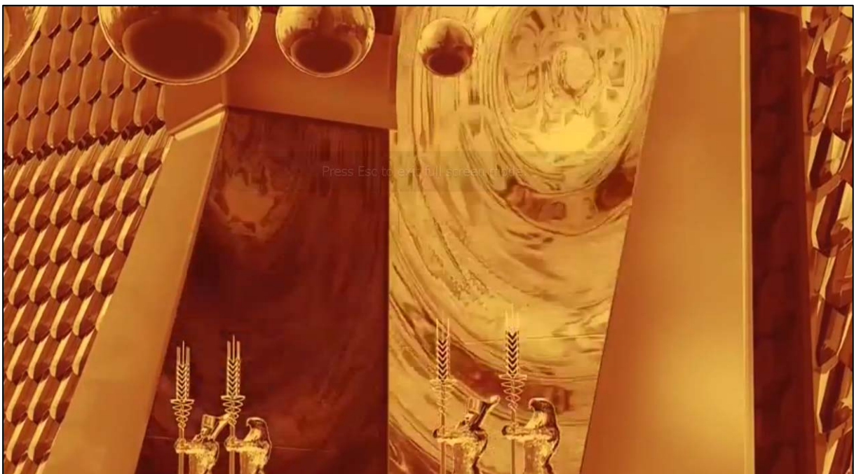
Image 3. Alexey Belayev-Guintovt. 55° 45' 20.83" N, 37° 37' 03.48" E. Photograph of digital video.